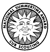
National Summertime Award pin for boys who attend all three summertime pack activities, No. 00464